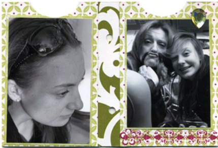
Page One: reverse side

Add photos as shown; accent with rub ons and self adhesive jewels.