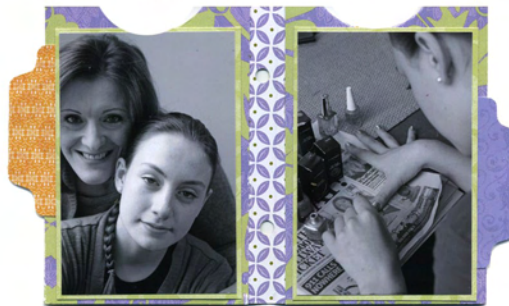
Page 3: reverse side

Add photos to page three front/back as shown. Punch a purple and yellow patterned tab from patchwork paper; holding page with outside up, adhere yellow to right hand edge of page, approximately one-quarter inch from top. Adhere purple tab to left hand edge, one-quarter inch from bottom.