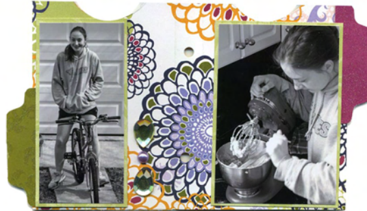
Page 2: outside

Add photos as shown; accent with jewels/rub ons if desired. Punch a pink and a green tab (from patchwork specialty paper) using hand punch (or die cut or trace from a template). Holding the page with the outside up, adhere the pink tab to the top right hand edge and the green tab on the lower left edge.